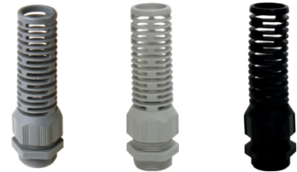
■ RAL 7001 ■ RAL 7035 ■ RAL 9005